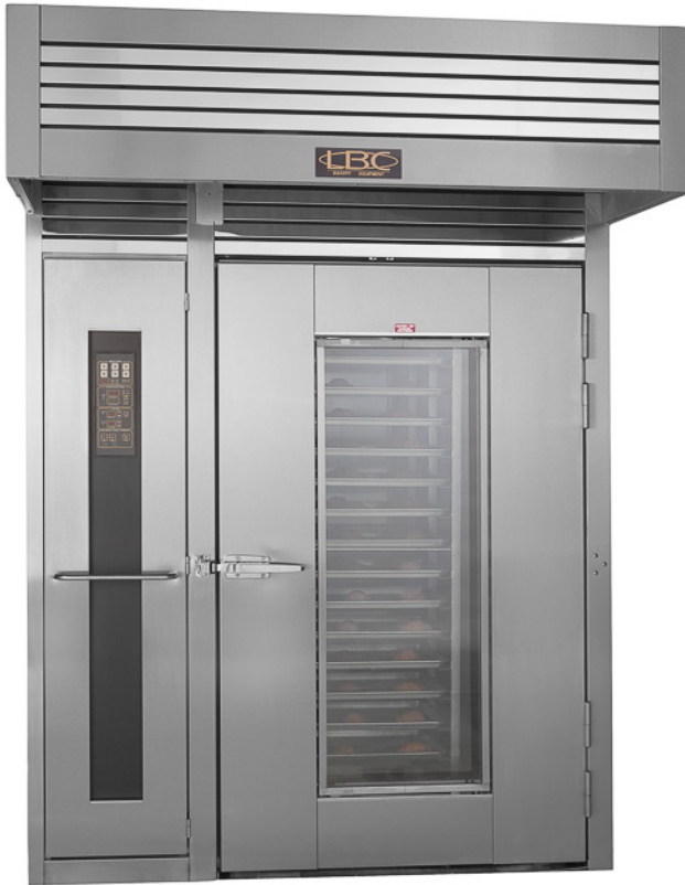
LRO-2G6 (Rack not included)