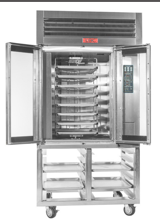
LMO-G (shown with 8-pan rack and optional 29" Stand)