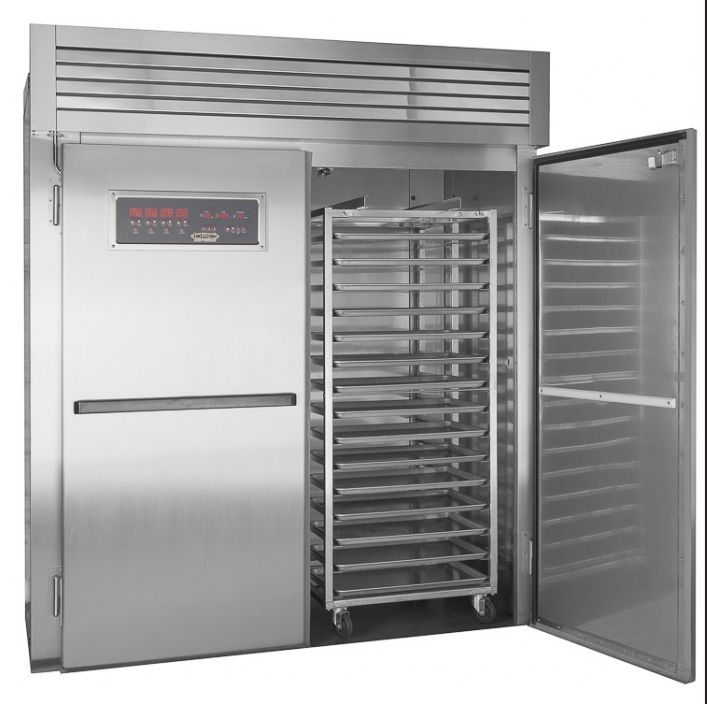
LRP3-130P (rack not included)