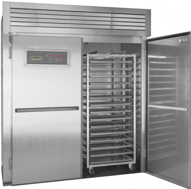
LRPR3-30HO (Rack not included)