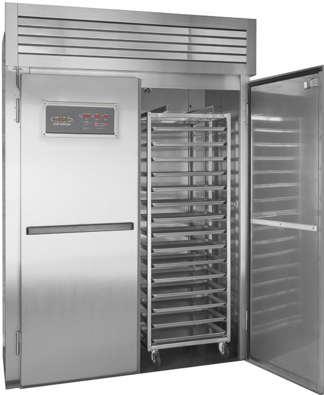
LRPR2N-30HO (Rack not included)