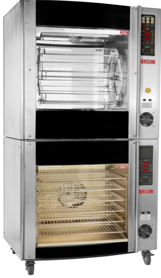
LRC7 Rethermalizer (shown with LCR7 Rotisserie)