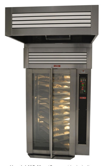
Hood, LMO Max (Oven not included)