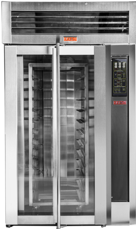
LMO Max-E (Rack not included)