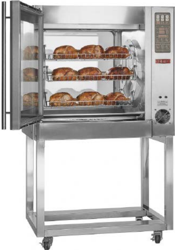
LCR7W Rotisserie (shown with optional LST7 Stand)