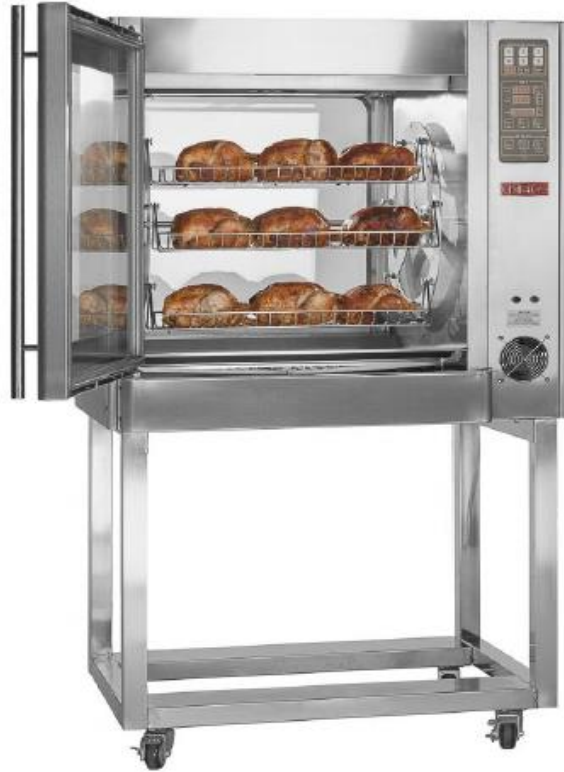
LCR7W Rotisserie (shown with optional LST7 Stand)