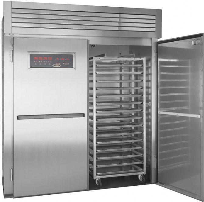
LRP3-130P (rack not included)