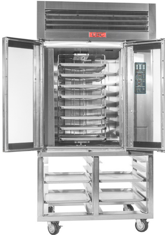
LMO-G (shown with 8-pan rack and 29" Stand)