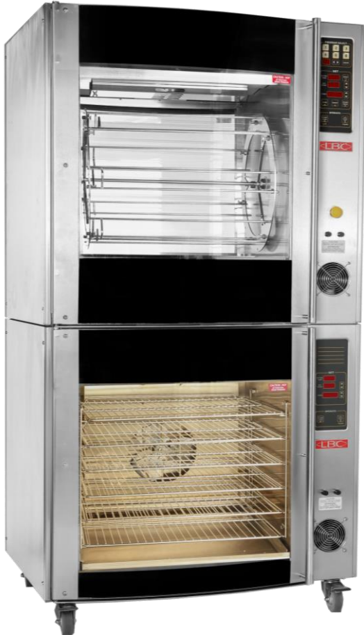
LRC7 Rethermalizer (shown with LCR7 Rotisserie)