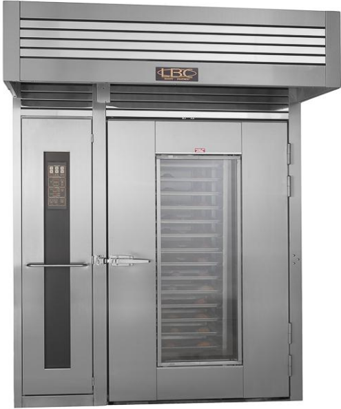
Model LRO-2G4 Shown