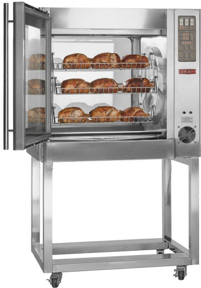
LCR-7W-2B with LRS7 Stand Shown