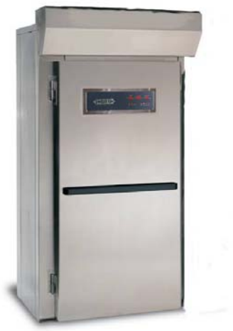
Model LRPR1-40 Shown