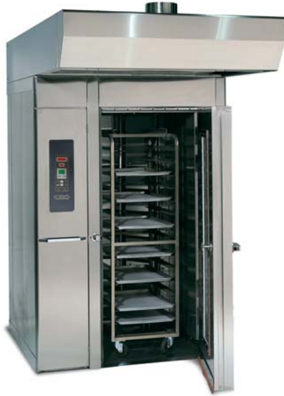
MODEL LRO-1 SHOWN (Rack not included)