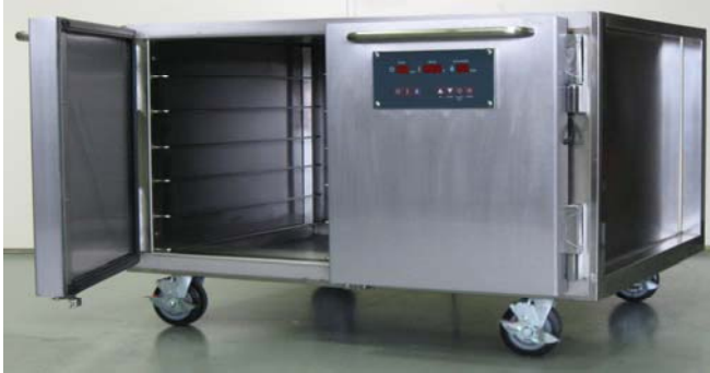
MODEL LMP-P Shown