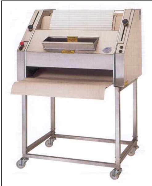
Model LBM-20 shown