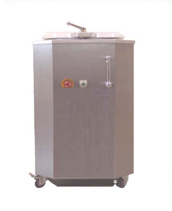
Model HDD-20 shown